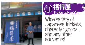
11 福得屋 Fukutoku-Ya

Painting experience of KOKESHI and Spinning top. Let's make your own original souvenir!