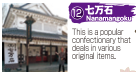
12 七万石 Nanamangoku

Wide variety of Japanese trinkets, character goods, and any other souvenirs!