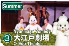
3 大江戸劇場 O-Edo Theater

Thrilling battle between ninjas break out in a house full of tricks!