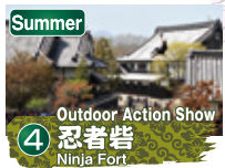
4 忍者砦 Ninja Fort

Enjoy flying ninjas' dynamic action under the sky!