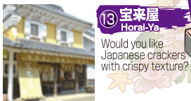
13 宝来屋 Horal-Ya

This is a popular confectionary that deals in various original items.