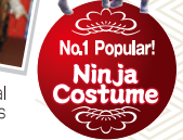
No.1 Popular! Ninja Costume

Famous large dumplings, other drinks and snacks.