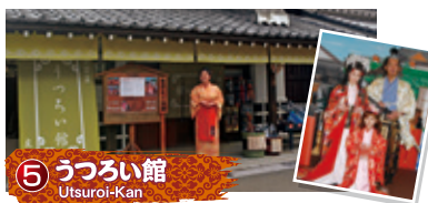
5 うつろい館 Utsuroi-Kan

Enjoy flying ninjas' dynamic action under the sky!