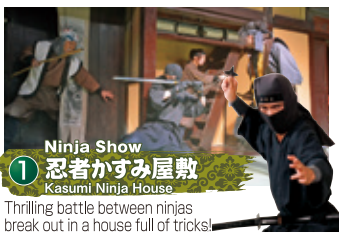
1 忍者かすみ屋敷 Kasumi Ninja House

Thrilling battle between ninjas break out in a house full of tricks!